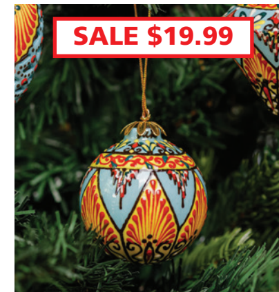
#435570 Uzbek Ceramic Ornament - Diamond $29.95 SALE $19.99